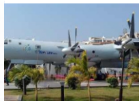
TU 142 Air Craft Museum