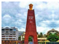
Victory at Sea War Memorial