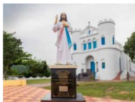
Ross Hill Church